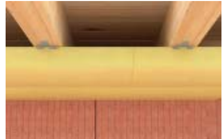
Pressure-resistant insulation boards on ceiling undersides