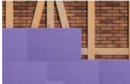
Pressure-resistant insulation boards on timber constructions