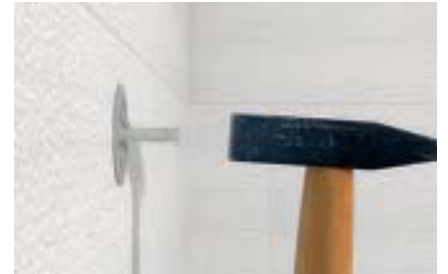
Setting the hammerset fixing on polystyrene rigid foam boards