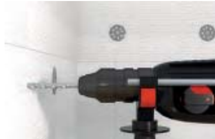
Polystyrene rigid foam boards